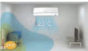
Without “Follow Me”

In most air conditioners the temperature sensor is located in the Indoor unit. In larger rooms, this may result in temperature differences in different parts of the room. One solution is the “Follow Me” function. Just press the button and the remote control acts as the temperature sensor to deliver you improved comfort wherever you are.