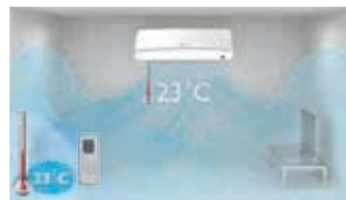
With “Follow Me”